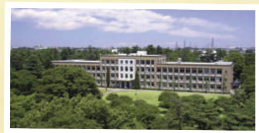
International Christian University (ICU) —University Hall

International Christian University (ICU) is a longstanding United Board partner in the areas of service-learning and peace studies and a host for United Board Fellows. The United Board provided funding for scholarships to Chinese students living in Hong Kong, enabling them to complete their undergraduate degrees at ICU. Over 30 years, about 120 Chinese scholars benefited from this program. UB